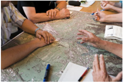
The results and findings of the Econnect project will be made broadly available.

In the frame of the "knowledge transfer" work package a policy-recommendation document is being elaborated, aimed at reaching the policy makers and responsible actors at local/regional, national and European level. The document will present concrete suggestions for political contents aimed at ensuring effective cross-border cooperation and the further development of ecological networks in the alpine region. In this way the results of the Econnect project will be made broadly available and far reaching effects of the project will be ensured. Apart from that a project synopsis is being produced containing the syntheses of objectives, activities, results and achievements of the Econnect work packages. The synopsis will ensure the sustainability of the project results, their broad distribution and their comprehension. Furthermore a toolbox-document is being compiled containing all methodologies adopted by the