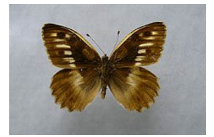
The endangered Rock Butterfly

Within the scope of the interregional Italian/Swiss programme, the "DIVERSICOLTURA -Biodiversity in the Cultural Landscape" project was recently approved. The project encompasses the Swiss Münstertal and the neighbouring Italian Obervinschgau. This area is part of the Econnect pilot region Rhaetian Triangle. As part of the project, measures are being implemented to preserve traditional cultural landscapes as living spaces for endangered species of fauna and flora. A joint strategy is being developed for the promotion of biodiversity and for cross-border living space connectivity. There are also plans to upgrade cross-border rivers as corridors for animals and plants and set up educational trails. DIVERSICOLTURA is therefore consolidating and supporting the efforts of Econnect, the Platform Ecological Network and the Ecological