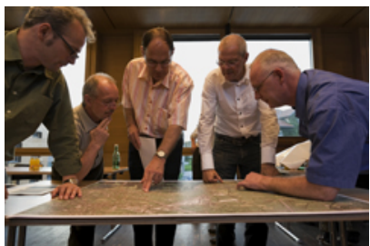
The second think tank workshop aims at identifying the needs and possibilities for the follow-up project beyond ECONNECT.

The Ecological Continuum Initiative organises a workshop to develop visions and to set the course for an assured continuation of projects beyond Econnect. The workshop will take place on November 17th 2010 in Bolzano/I. The workshop aims at defining new project ideas and elaborating projects on ecological connectivity in the Alps. The maintaining of approved partnerships, as well as the build-up of new project partnerships is an additional goal of the workshop.