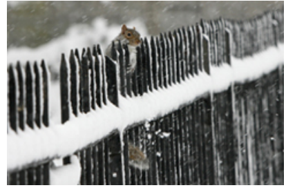
Photos help to make people aware that they create obstacles to the free migration of plants and animals.

The partners in the Econnect project invite amateurs and professional photographers to make a pictorial record of ecosystem fragmentation in the Alps. The photo contest "Clicks beyond the borders" aims to visualize the importance of ecological links in the Alps in powerful images. The pictures should show barriers to ecological connectivity as well as strategies of animals and plants, helped by human beings, to surmount these barriers. The closing date is 15 January 2011. There will be awards for the twelve best pictures. These will also be exhibited during the final conference of the ECONNECT project in Berchtesgaden/D and be reproduced in a calendar. With this contest, the partners in the EU-funded three-year project ECONNECT want to make the public more aware of the theme of ecological connectivity: although the theme is a very important one, it has received little attention in the popular media so far.