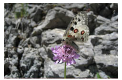
Apollofalter as focal species for extensive grasslands in the Pilot Region Berchtesgaden -Salzburg

Important steps towards implementing connectivity measures in the course of Econnect have been made in the pilot region "Berchtesgaden - Salzburg". In order to analyse the connectivity of extensively cultivated grasslands in the region a set of butterfly and grasshopper species has been defined. Measures to improve the quality of certain grassland habitats will be planned and implemented subsequently. Additionally, several other possibilities are analysed to develop ecological connections in the pilot region, like e.g. the revitalisation of a small river. It will support the migration of rare fish species for reproduction as well as enable the development of natural structures of high ecological value. Another major aspect in "Berchtesgaden - Salzburg" is the role of landscape planning, especially in a transboundary context. A workshop jointly organised with the State Government of Salzburg will enhance the transboundary exchange of experts in the field of landscape planning and ecological networks.